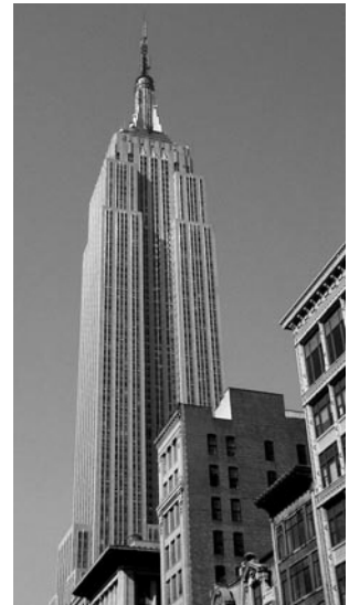
One Terabyte: Imagine stacks of paper piled sixteen times as high as the Empire State Building being used as a standard of measurement...Now that's a good argument for going "green"!

If you want help in determining the right protection for your specific network, give us a call at 201-797-5050.