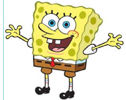
SpongeBob SquarePants® Viacom International

How much deeper would oceans be if sponges didn't live there?