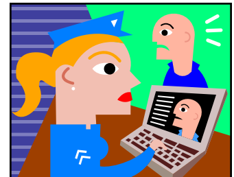
Airport management is now taking a more responsible role in the steps to counter against wireless theft and online fraud via Wi-Fi Hotspots.