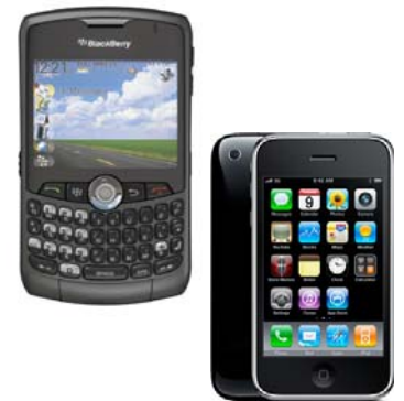
The Blackberry and the iPhone are two popular models of PDA/Smartphones. They allow you to make calls, get e-mail and surf the web.