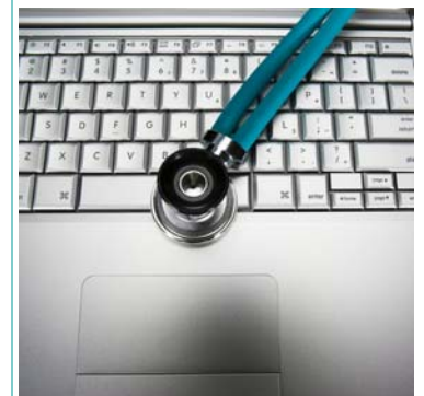
Germs like to breed on office surfaces. If you wipe your phone with a disinfectant and do the same with your keyboard and mouse, you may reduce your odds of catching a cold or flu.

It has been said that if you sneeze, try to do so in a handkerchief/tissue or against your sleeve rather than in the air or into your hands. Be aware that you may sneeze into your hand or shake hands with someone who has at any time of day [sneezed into his/her hand and NOT washed]. Just remember what your mother said about personal hygiene and you'll be alright.