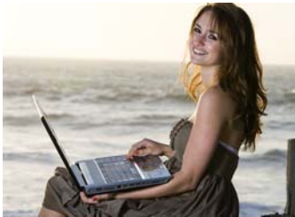
Feedback & Suggestions...

Visit our blog at http://insightsforsmallbusinesses.blogspot.com