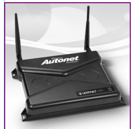
Take a Wi-Fi hot spot wherever you may roam with the new UConnect® Mobile Internet Service from Chrysler-Jeep-Dodge in 2009..

The router in a Chrysler vehicle broadcasts in a 100-foot radius with speeds anywhere from 400-800Kbps. Think about the possibilities, you could watch a little television on hulu.com while you relax on the beach this summer.