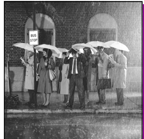
Have you been caught off-guard by a sudden deluge? Are you protected for the next storm? Learn from the past; give us a call, we can help you prepare.