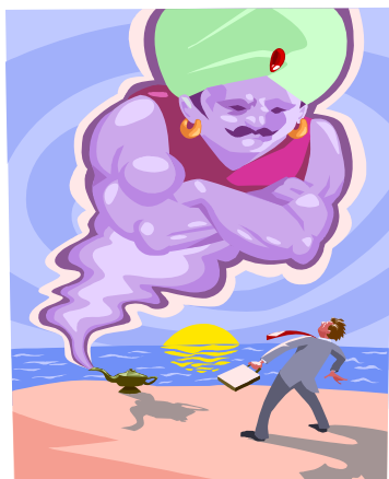
But I can't read Word 2007 files!